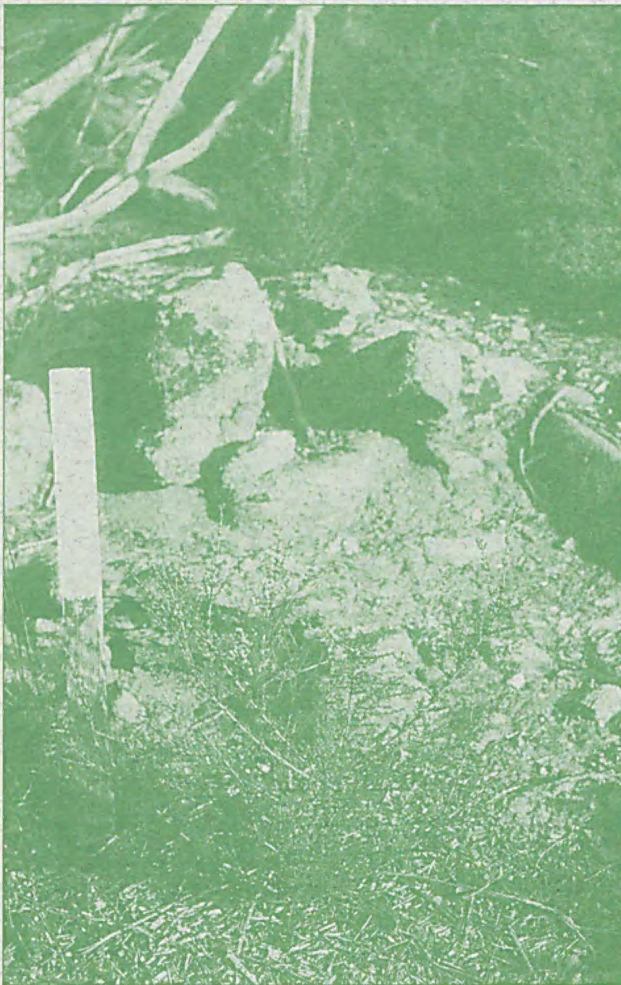
A translocated Prostanthera eurybioides at John Boland's and Chris Bryant's property.

outcrops, in amongst melaleucas or some such cover, and probably not on exposed northern aspects. A large number of extant plants on our property already defy one of these — they grow on a very exposed northerly facing slope. So we have tried to cover many other possibilities in our plantings, including in sandy soil in open woodland, on exposed areas but on rocky outcrops and in scrub but on sandy soil. The survival rates at first glance don't seem to differ much, but in some of those trials only low numbers have been involved so we will have to continue to monitor future plantings. This coming spring we will be undertaking another survey with the assistance of the Centre.